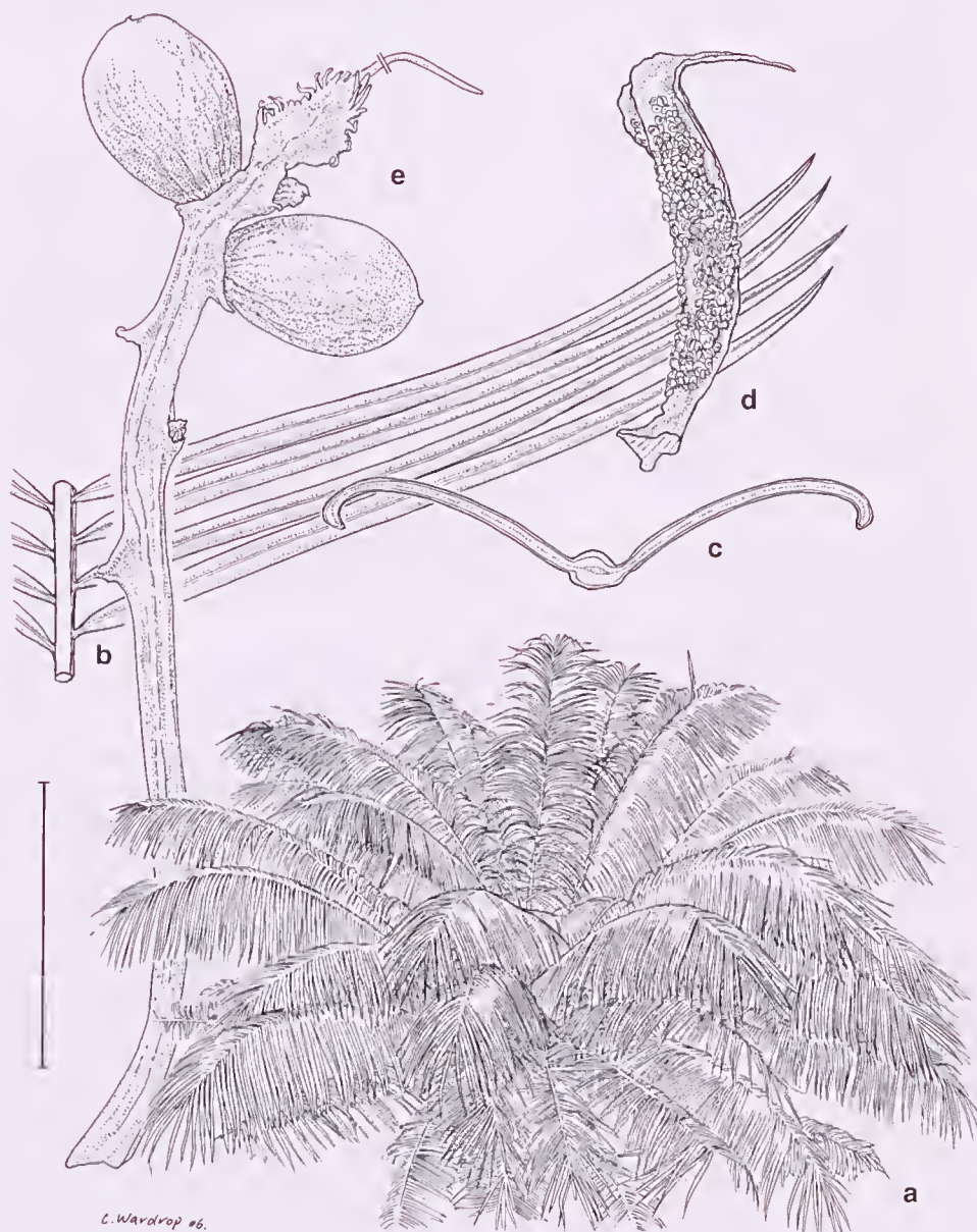
Fig. 5. Cycas lacrimans . a, sketch of habit (from A. Lindstrom slide). b, part of leaf. c, cross-section of leaflet (from Lindstrom AL 06/004). d, male sporophyll (from NY digital image of NY sheet of Ramos & Edano 48953). e, female sporophyll (reconstructed from Lindstrom AL 07/018). Scale bar: a = no scale, b = 10 cm, c = 0.6 cm, d = 6 cm, e = 3 cm.